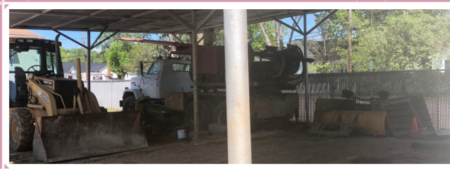
Covered Parking Area