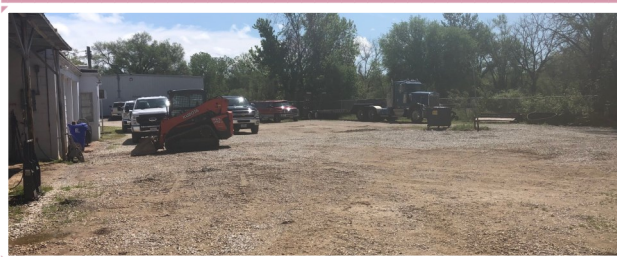
Back Construction Yard