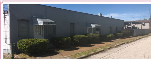
Front of 318 E. Union Street

318 E. Union Street Pacific, MO 63069 Construction Yard & Office