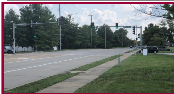
Pier side Intersection