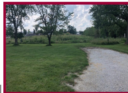
419 Old State Entry