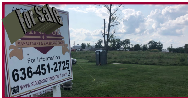
419 Old State looking West