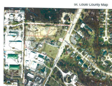
Site's Arial View